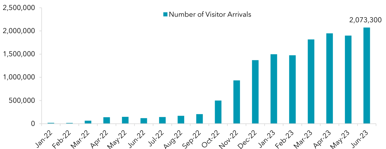
Number of Visitor Arrivals between January 2022 and June 2023

Source: JNTO (as of the end of June 2023)