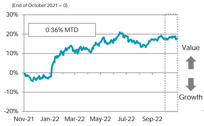
Figure 3. Value-Growth Spread