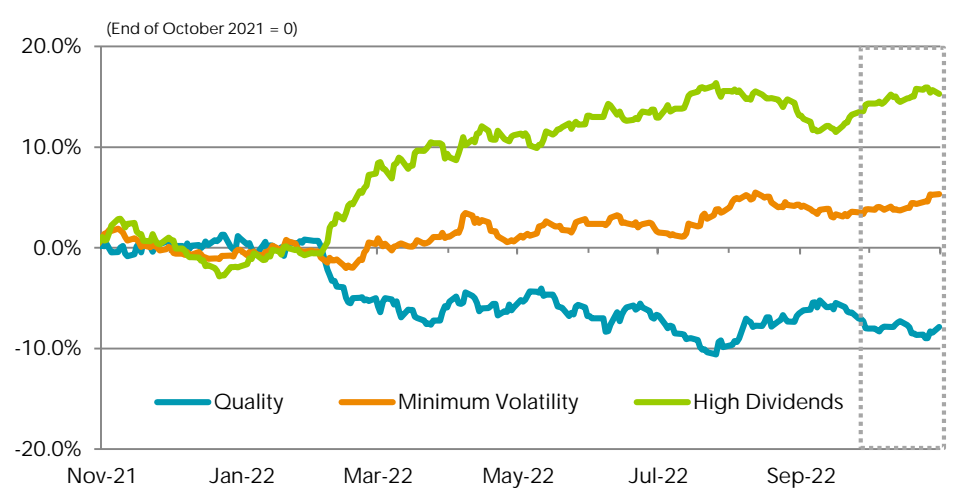
Figure 5. MSCI Japan Factor Indexes Spread against MSCI Japan

Data: Bloomberg, Nomura, SuMi TRUST (as at the end of October 2022)