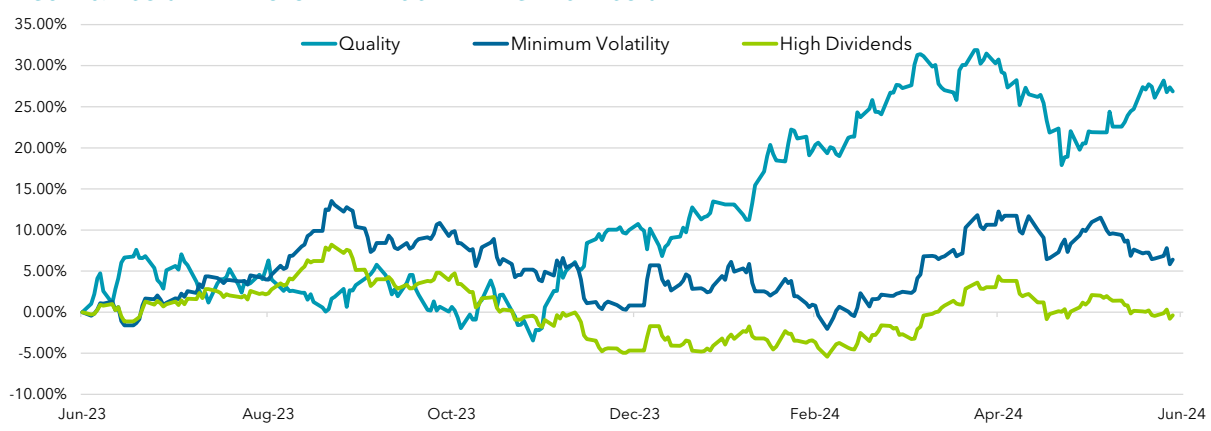
FIGURE 5. MSCI JAPAN FACTOR INDEXES SPREAD AGAINST MSCI JAPAN*

Note: The spread between the Russell/Nomura Large Cap Index and the Small Cap Index (Positive figure means Large Cap dominant)