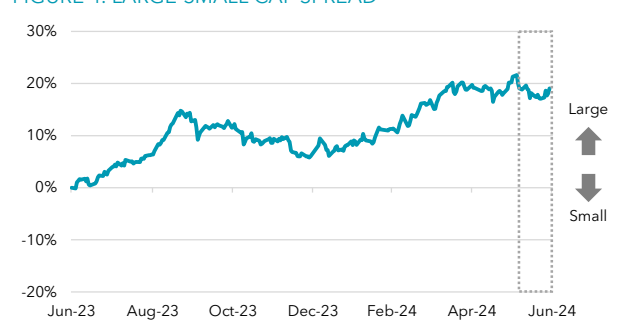
FIGURE 4. LARGE-SMALL CAP SPREAD

Note: The spread between the Russell/Nomura Large Cap Index and the Small Cap Index (Positive figure means Large Cap dominant)