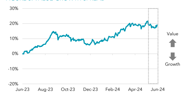
FIGURE 3. VALUE-GROWTH SPREAD

Note: The spread between the Russell/Nomura Value Index and the Growth Index (Positive figure means Value dominant)