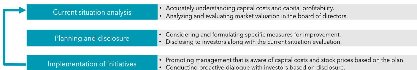
Figure 2. Measures towards achieving management that considers capital costs and stock prices